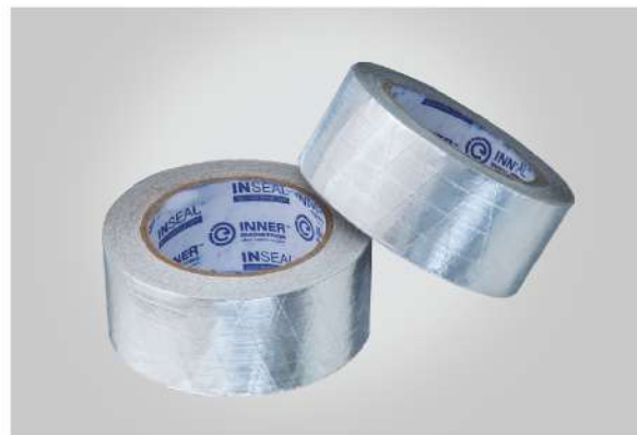
FSK (Foil-Scrim-Kraft) Tape