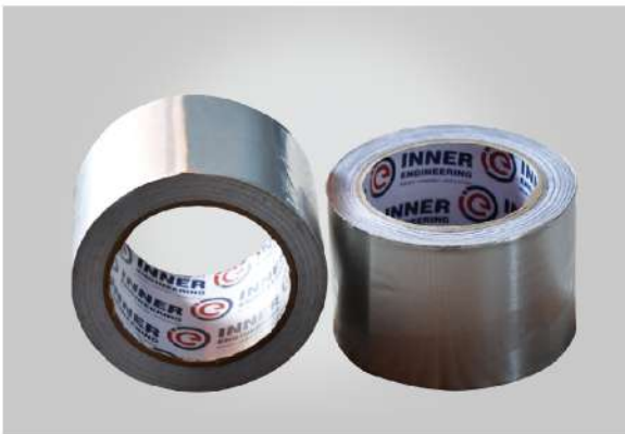
Plain Aluminium Foil Tape