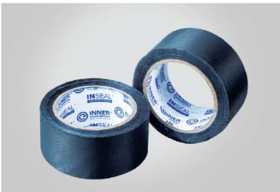
Glass Cloth (GC) Tape