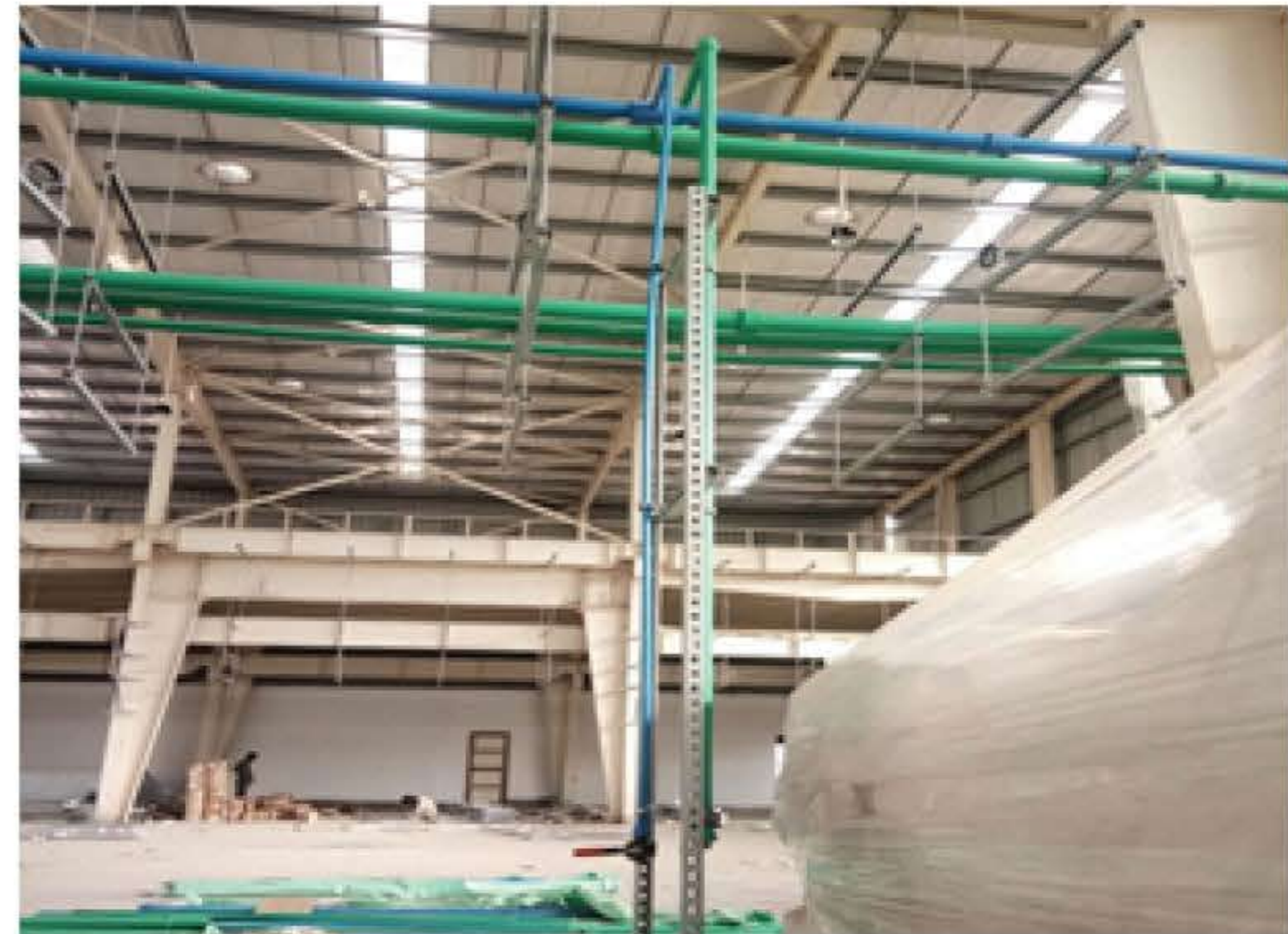
Nirmal Poly Plast, Ahmedabad