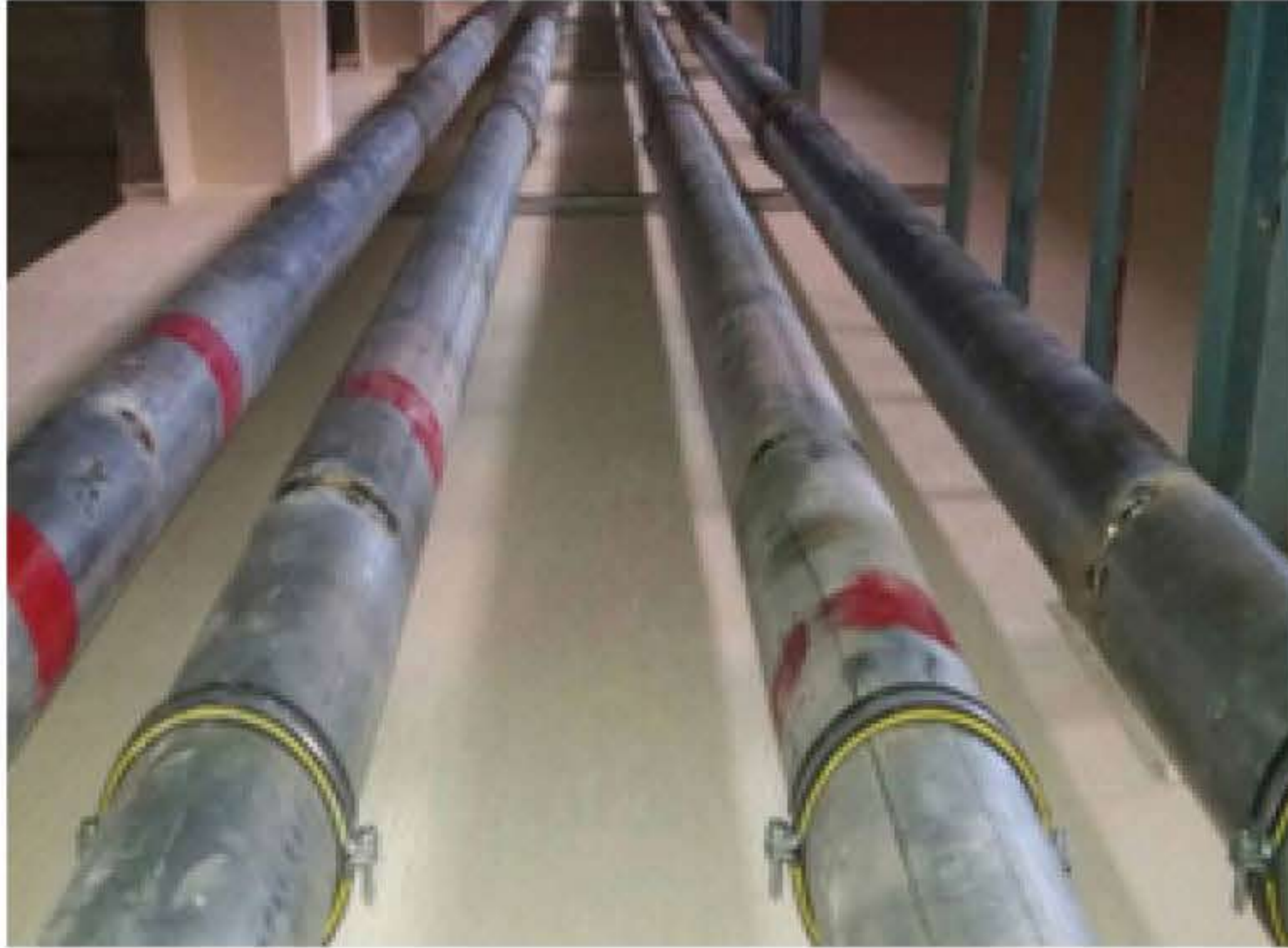
Bella De More, Surat