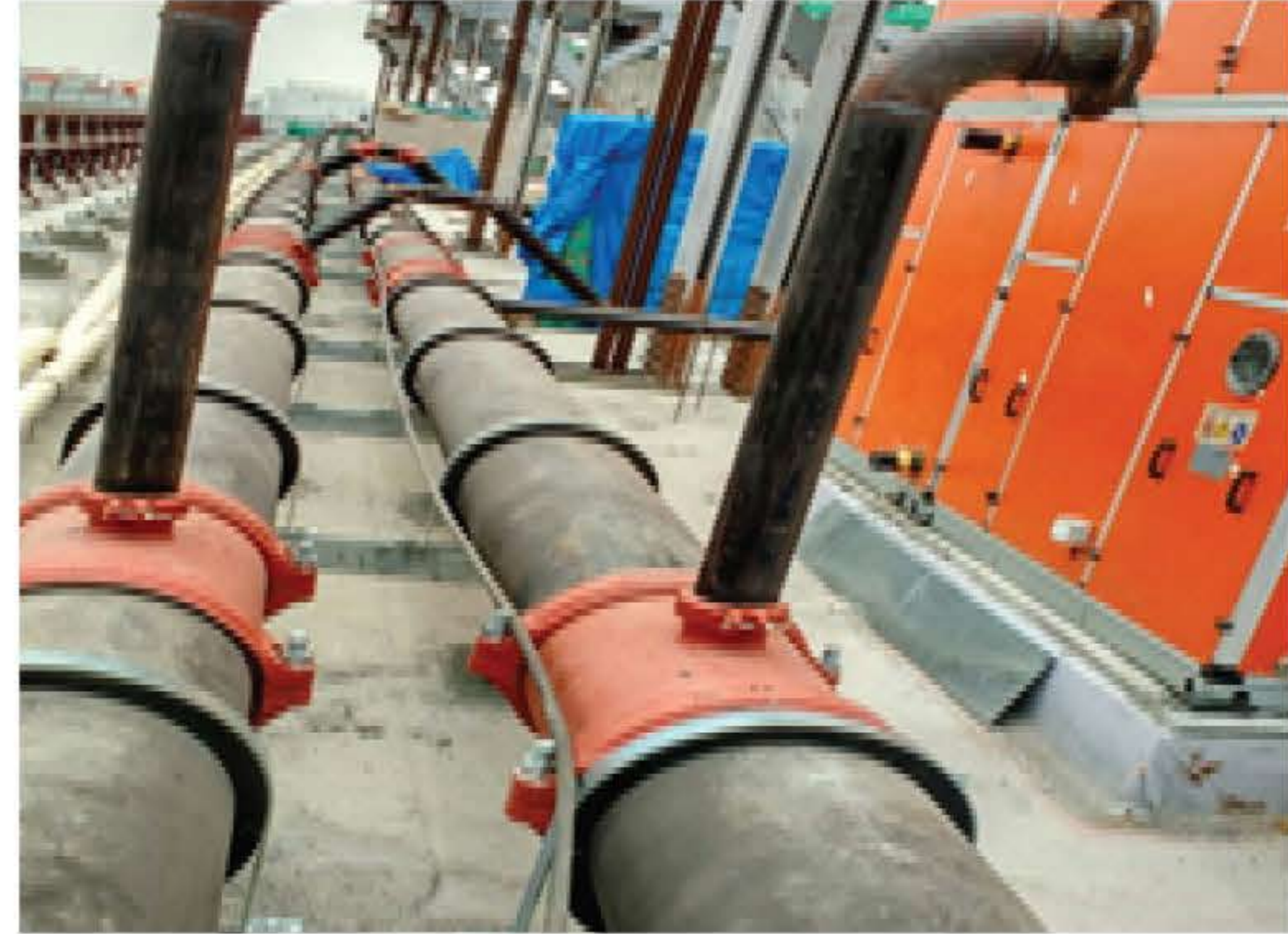
MSPVL Adani, Mundra