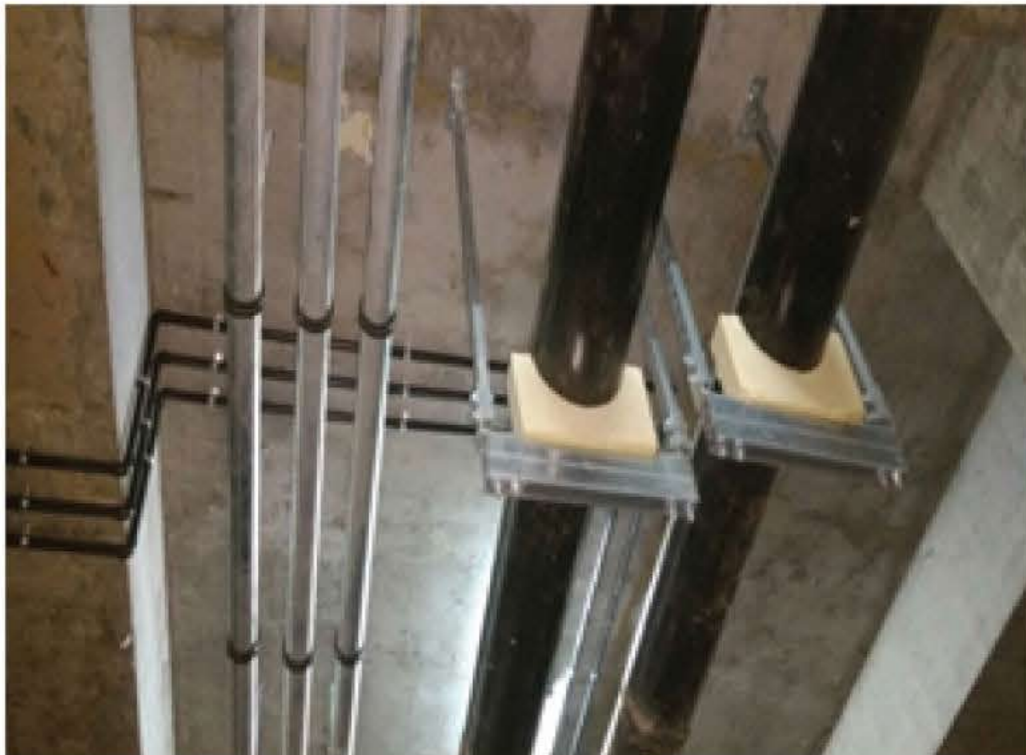
Sankalp Hotel, Ahmedabad